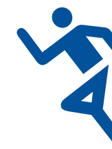
Our first track and field team took off running last Spring